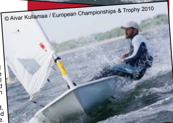
European Championships &amp; Trophy 2010