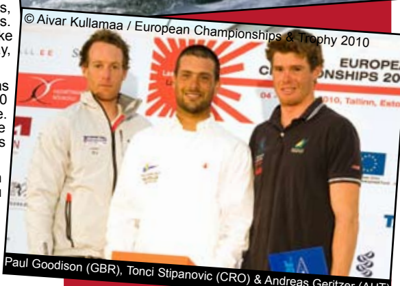
European Championships &amp; Trophy 2010