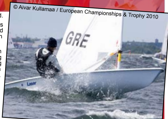
© Aivar Kullamaa / European Championships &amp; Trophy 2010

For daily reports, full results and more images, please go to www.laser2010tallinn.eu .