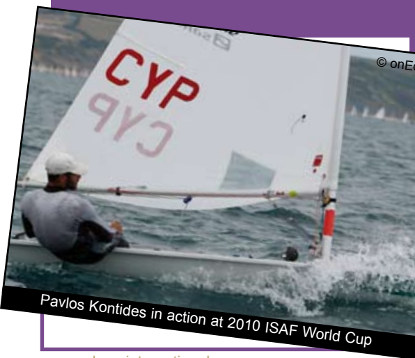
Pavlos Kontides in action at 2010 ISAF World Cup