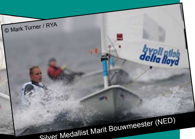
Silver Medallist Marit Bouwmeester (NED)