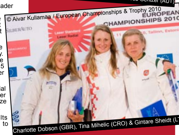
European Championships &amp; Trophy 2010