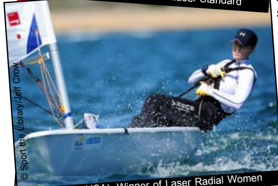
Paige Railey (USA), Winner of Laser Radial Women