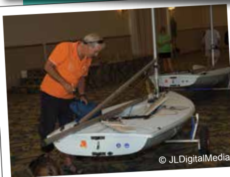
Prepare your sail before the event to avoid pressure and mistakes!