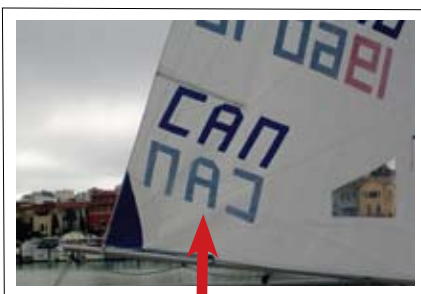
Not clear - mixture of upper and lower case!