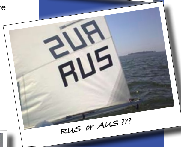
RUS or AUS ???