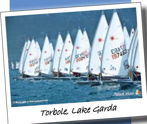
Assolaser Torbole, Lake Garda