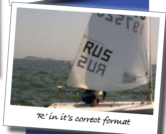
'R' in it's correct format