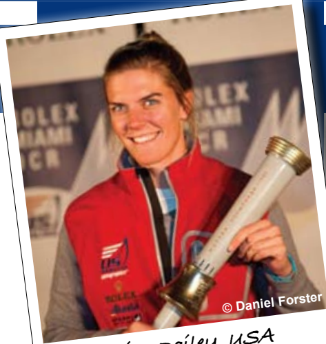
Paige Railey, USA World Ranked No.5 (23/11/11 ranking)