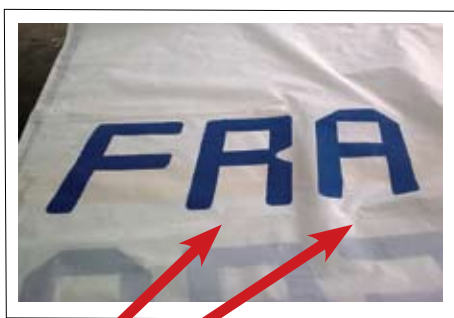
A or R?