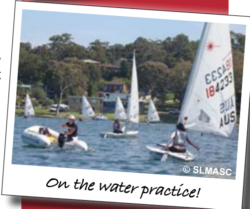
On the water practice!