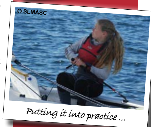
Putting it into practice ...