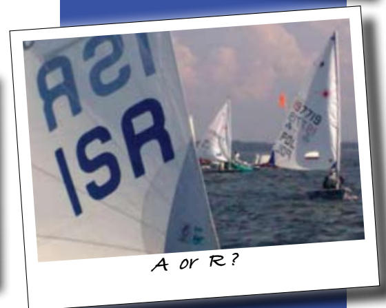
A or R?