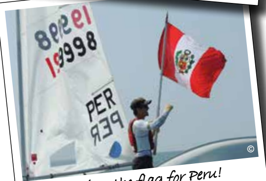
Flying the flag for Peru!