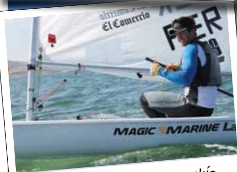
Magic Marine Sponsorship