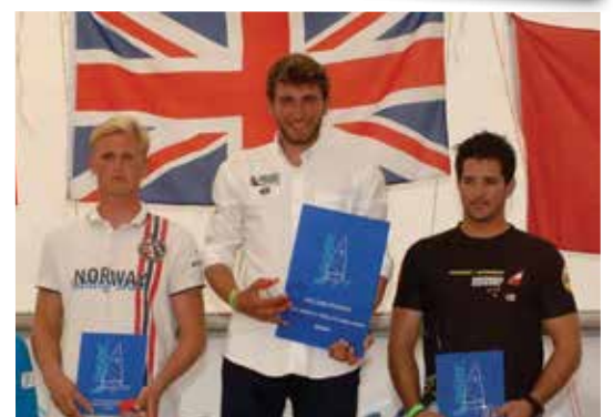
2014 Laser Standard Men's U21 World Championship, France